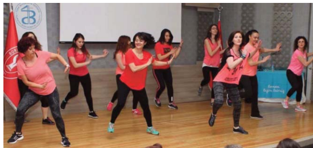
Figure 2 Ege University Medical Doctors Zumba Group.

As a gratifying outcome of the Insulin Resistance Symposium, all presentations, discussions, opinions and suggestions were taken into consideration for creating a health strategy and policy against insulin resistance and related health problems in Turkey.