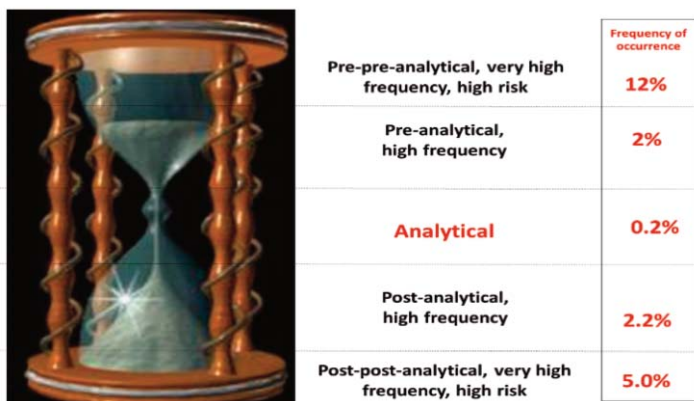
FIGURE 1. The hourglass model of laboratory-related diagnostic errors.