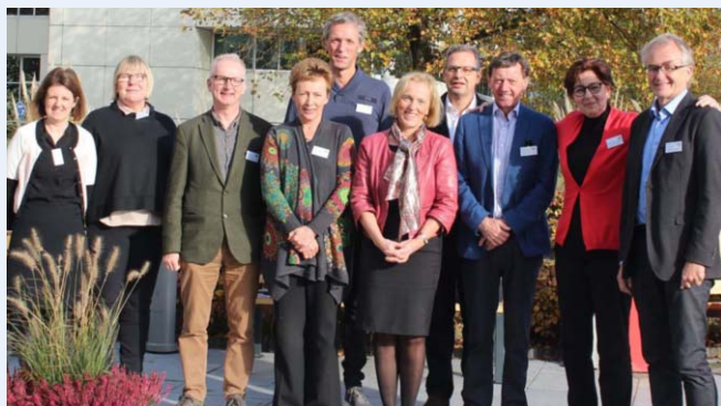
The EFLM-AACB Working Group on Test Evaluation

The needs and interests of the diverse group of professionals involved in the test development process from biomarker discovery to implementation in clinical practice will be covered. To get an idea of other activities of the EFLM WG on Test Evaluation, click here .