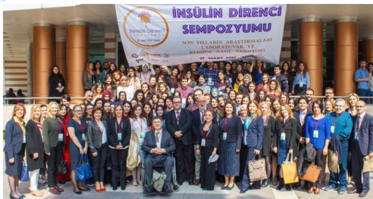
Figure 1 Group Photo: Insulin Resistance Symposium in İzmir-Turkey on March 22, 2017.