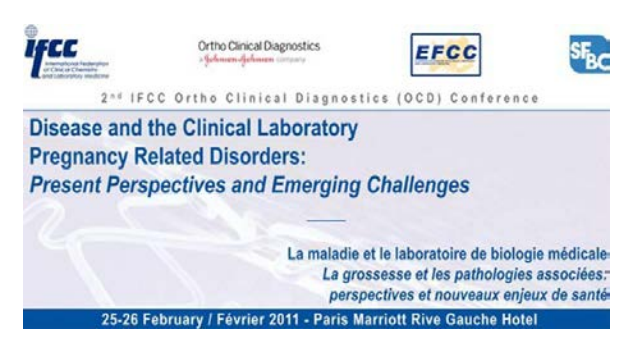
The Speakers' presentations of the 2nd IFCC/OCD Conference on "Pregnancy Related Disorders" are now available in the IFCC website under the section "Congresses & Conferences"