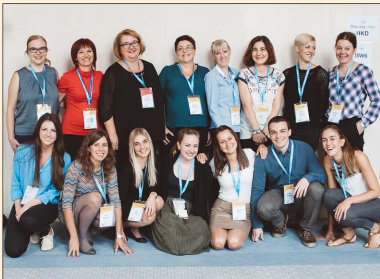
Photo: Congress Organizing Committee with President of the Scientific committee and student volunteers.

success. Joyful closing ceremony of the Congress and useful comments from the participants will certainly serve as basis for an even more successful 9th CSMBLM Congress in 2018.